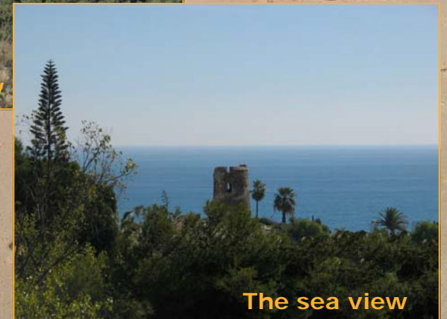
The sea view