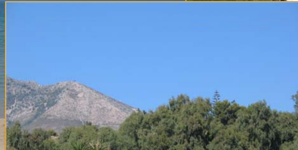
The mountain view