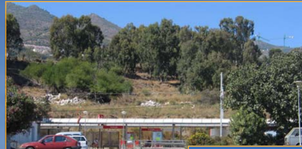
Railway to airport

The investor has the option to sell the property prior to completion and realize capital gain.